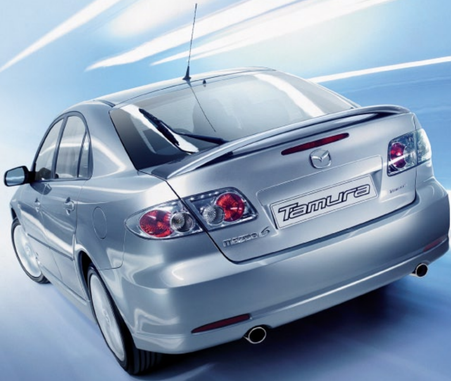
MAZDA6 2.0 SDR TAMURA IN SILVER CONTRAIL METALLIC, SHOWN THROUGHOUT