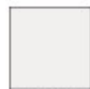
Crystal White Pearl Mica