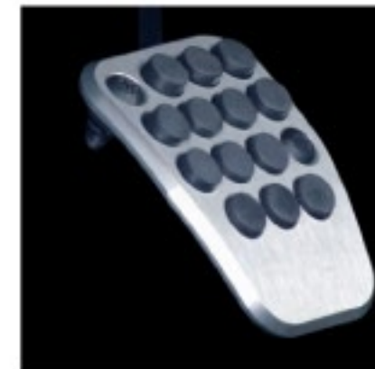
Alloy pedal set