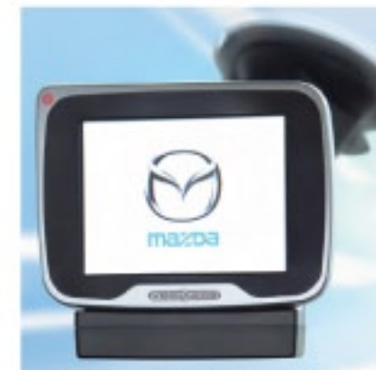
Navimaster satellite navigation system