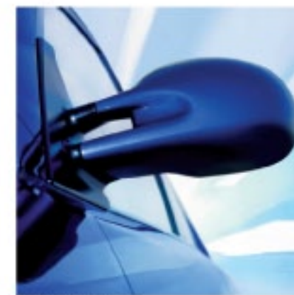
Sports door mirrors