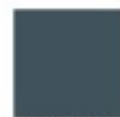
Galaxy Grey Mica