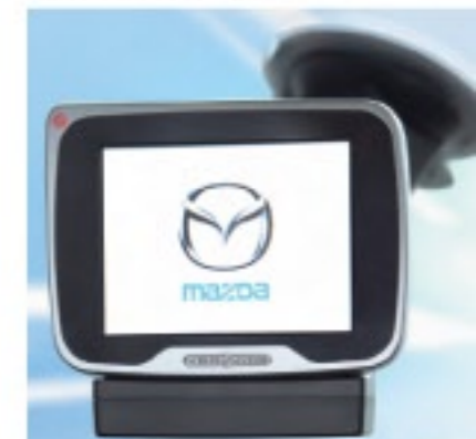
Navimaster satellite navigation system