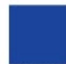
Aurora Blue Mica