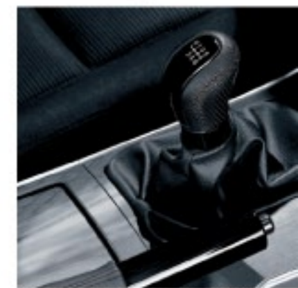
Piano Black gearknob and handbrake lever