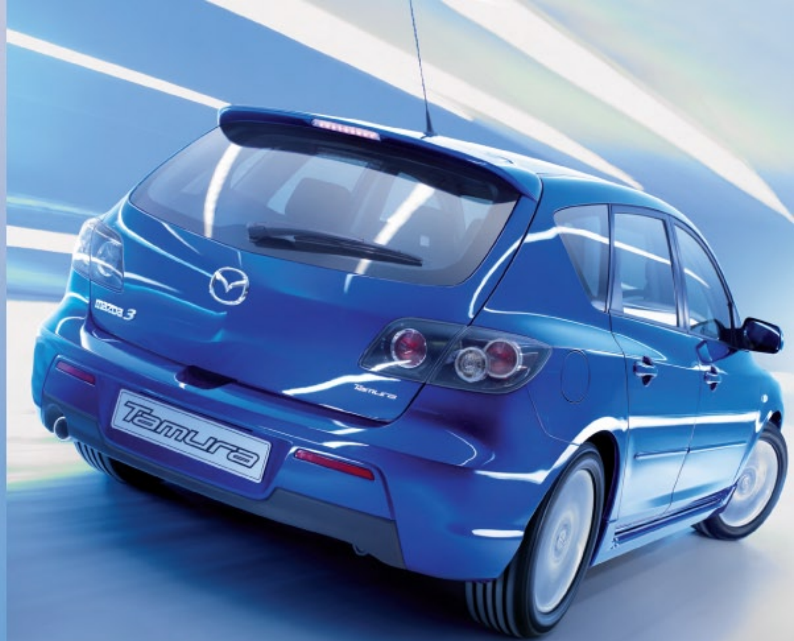
MAZDA3 1.6 SDR TAMURA IN AURORA BLUE MICA, SHOWN THROUGHOUT